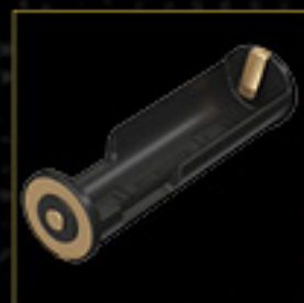
CR123 Battery Magazine