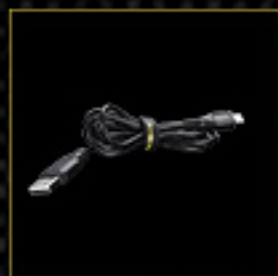
USB-C Charging Cable