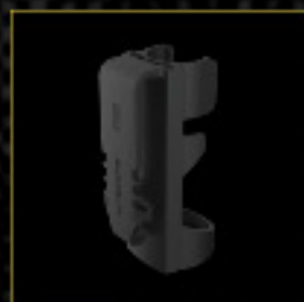
Tactical Holster NTH20