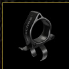
NTH25 Tactical Holster