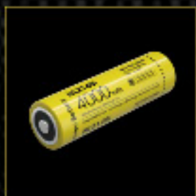
NL2140i Battery 4,000mAh